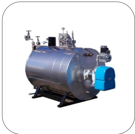
High Pressure Steam Boiler