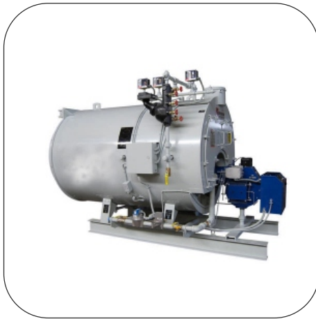
Oil Fired Boiler