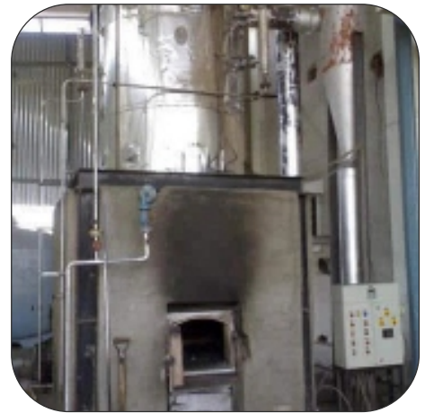
Coal Fired Thermic Fluid Heater