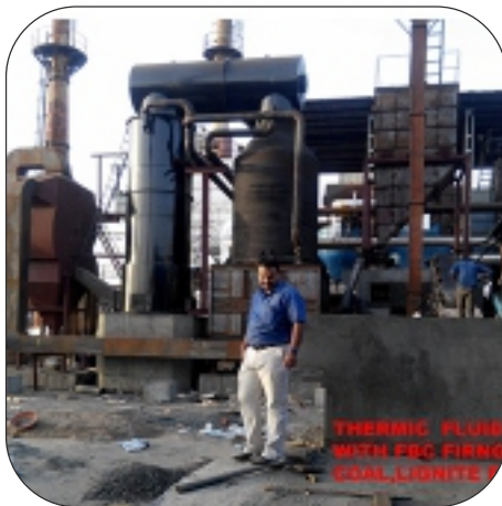
Thermic Fluid Heater- FBC Coal Fired