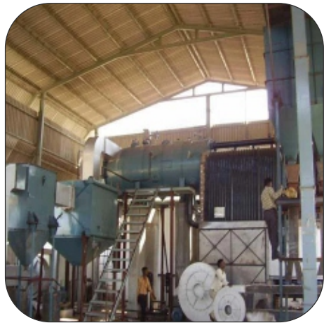
Fluidized Bed Combustion Boiler