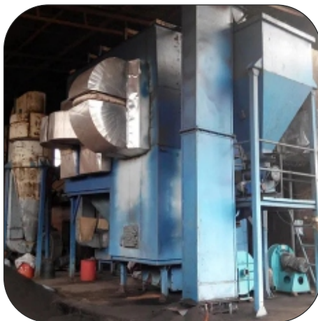
FBC Hot Air Generator - IHAG