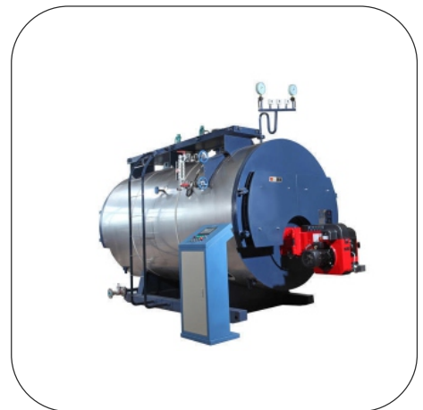
Horizontal Steam Boiler