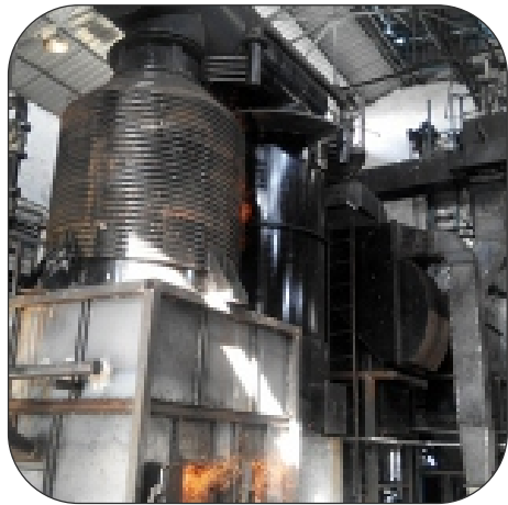
Thermic Fluid Heater 4 Pass FBC