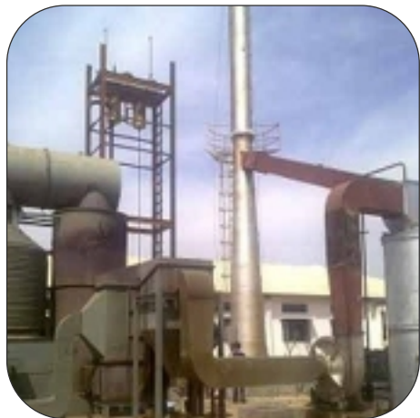
Vertical Four Pass Wood Thermic Fluid Heater