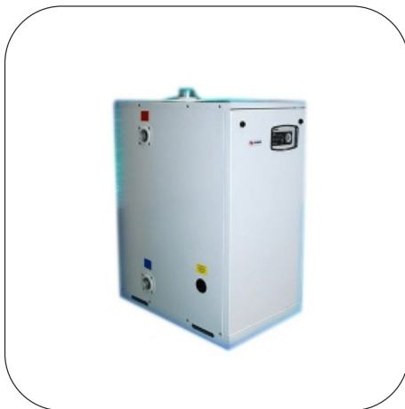
Liquid Fuel Boiler