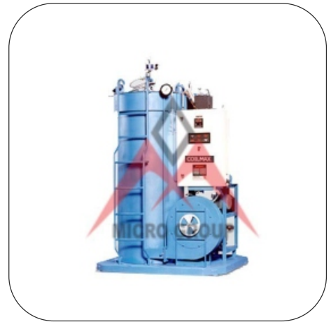
Gas Fired Boiler