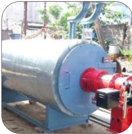
Hot Water Recirculating System