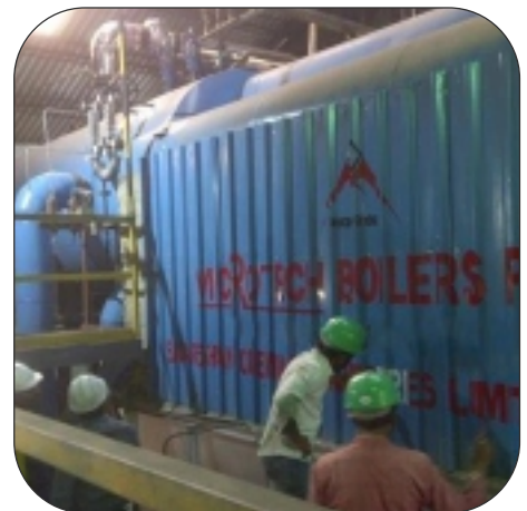
Fluidized Bed Biomass Boiler