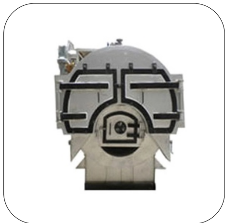
Biomass Steam Boilers