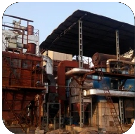
FBC Thermic Heater With ESP