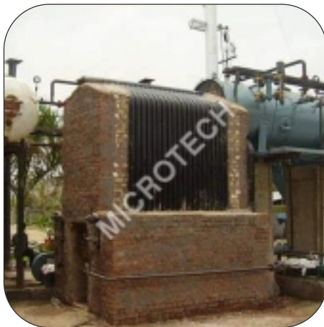
IBR Steam Boiler